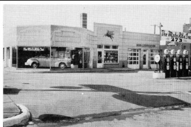
The new location of MotoRite, Inc., Studebaker dealers in St. Louis, Mo., permits a diversification of business that is conducive to consistent profits. Revenue from their modern gasoline station supplements the income from their equally modern service station which includes an excellent parts department, a customer waiting room, two lubrication boists, and four stalls for customer work. A large parking area is provided in the rear. The shadow of the Authorized Service Sign, which is mounted on a post at the curb, can be seen on the pavement foreground. (Parts & Accessory News April 15, 1942)