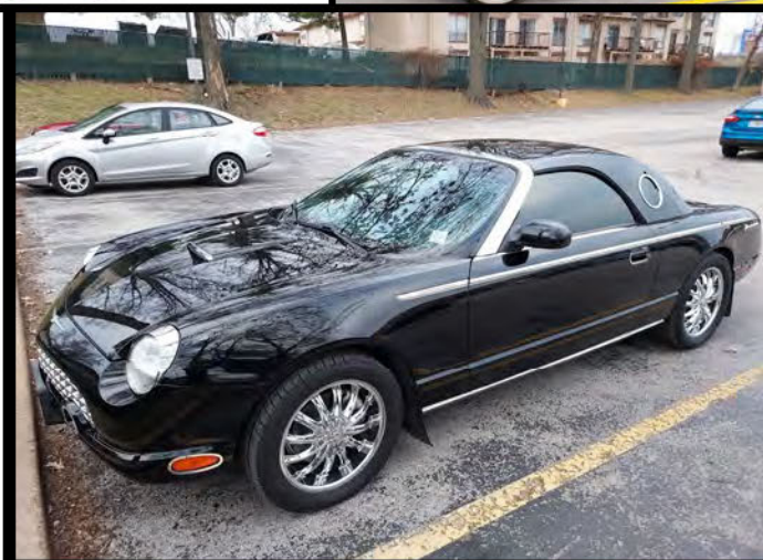
Louetta's 2-seat Thunderbird