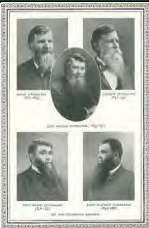
The five Studebaker brothers.

I hope you enjoy the show--I'll be interested in your thoughts. See you here in Washington on Sunday, March 8th!