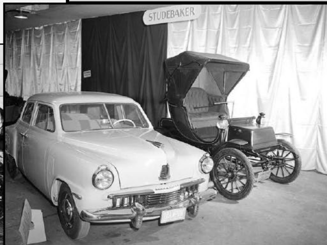
A 1947 Studebaker Champion and a Studebaker Electric.