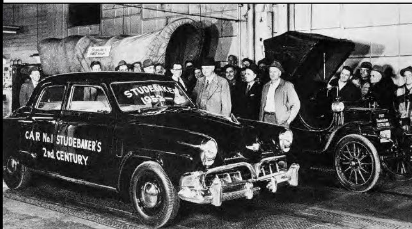
Studebaker's 100th Anniversary Celebration.