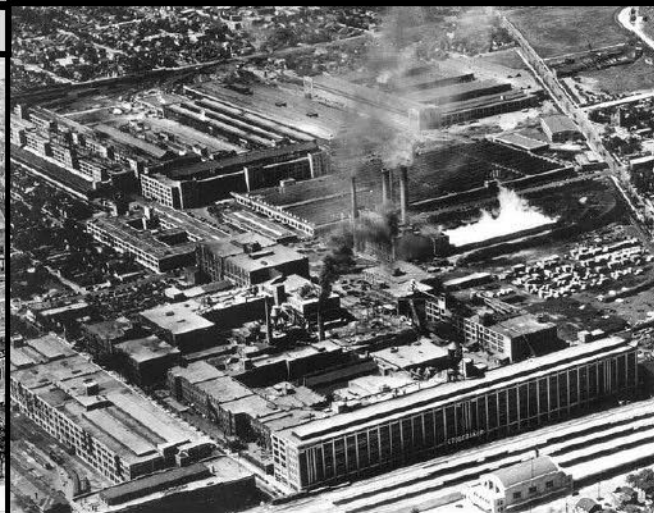
Photos of the South Bend Studebaker plant from left to right in 1875 and in 1963.